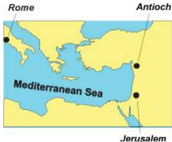
Cities where Simon Peter worked as an apostle

The Church in Rome became the most important Church for other Christians. It was in Rome where the two greatest leaders of the early Church, Peter and Paul, were martyred.